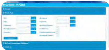
AMT Mobile Check-In Screen

AMT Mobile is a new module of AMT which runs on a Tablet PC. It allows users to "check out" data from AMT and work offline, then "check in" data some time later.